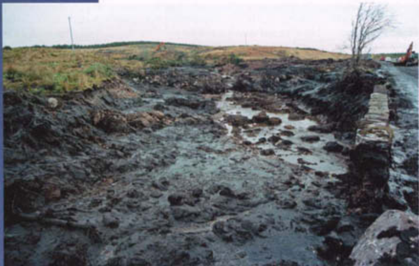
Carbon released in the Derrybrien "bogalanche" will offset the saving of two of the site's turbines