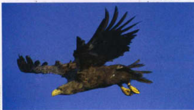
Sea eagles and turbines are a fatal combination

In the US and Australia many wind farms are built in desert regions. The ecological impact in these environments is largely unstudied. Somnath Baidya Roy from Princeton University and his team have done research suggesting that rotating turbine blades lead to desiccation of the surrounding area, which may be particularly damaging in deserts ( Journal of Geophysical Research Atmospheres , DOI: 10.1029/2004JD004763). In addition, a recent study of Californian ground squirrels reveals that those living close to wind farms are more edgy and cautious than those that inhabit areas of desert where there are no turbines. Lawrence Rabin from the University of California, Davis, and colleagues conclude that this is likely to have a knock-on effect within the ecosystem, affecting species including golden eagles, red-legged frogs and California tiger salamanders. They, like Lindsay, argue for greater care in siting